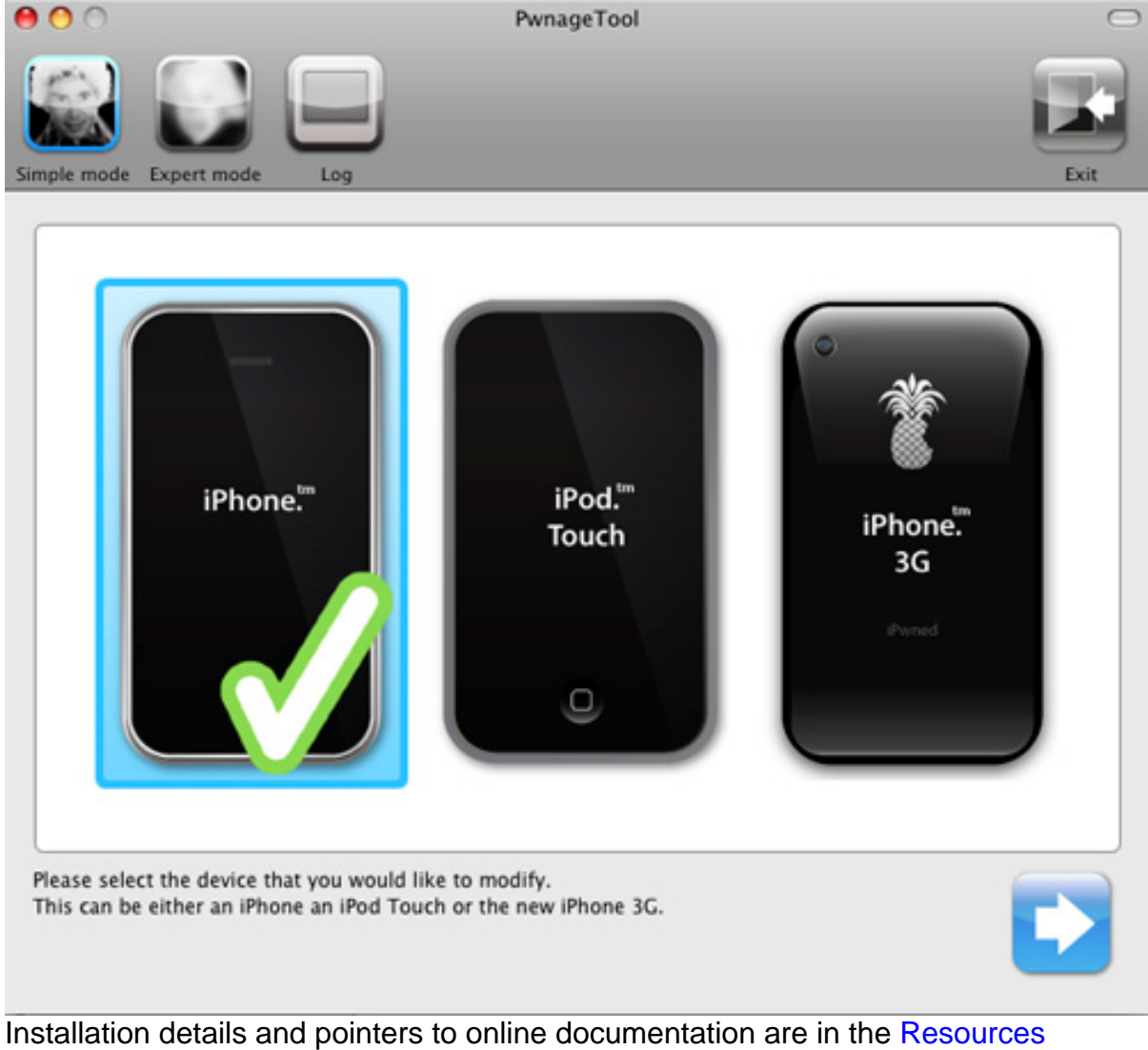
Figure 1. Pwnage is flagship tool for jailbreaking and unlocking iPhones

Installation details and pointers to online documentation are in the Resources section. Basically, Xpwn, Pwnage, and WinPwn allow you to create a jailbroken version of the iPhone OS on your computer. Then you use iTunes to download the jailbroken OS into your iPhone. This sounds more complicated than it really is. The tools do all the difficult work and use the same automated mechanisms Apple uses in iTunes to upgrade the iPhone OS.